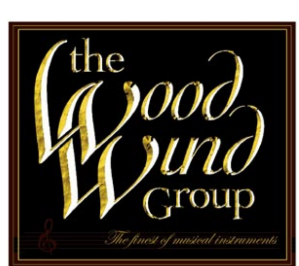
Suite 1 / 111 Moore Street (The old hat factory) Leichhardt 2040

Corner of Moore Street & Balmain Road. Leichhardt