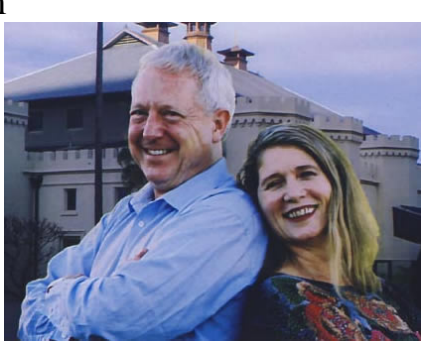
Grevillea Recital Voice, Piano & Flute